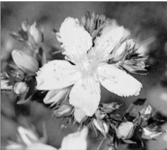
St. John's wort

effectiveness of St. John's wort is inconclusive. It does have side effects, and people with hypertension or who are taking any other medications should be extremely cautious about taking it. St. John's wort should be taken only with the advice and follow-up of a physician.